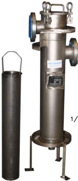
602S with Insulation Retainer